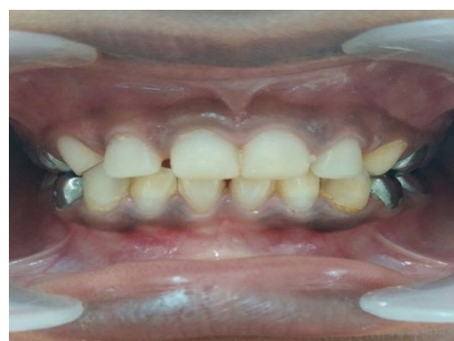
Figure 5: Placement of strip crowns