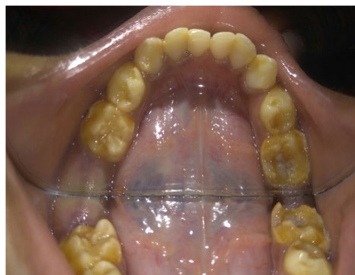
Figure 2: Pre-operative picture of mandible