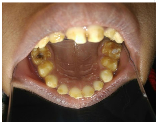
Figure 3: Pre-operative picture of maxilla

Anterior teeth were prepared to receive composite strip crowns.