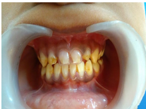
Figure 4: Preparation for placement of strip crowns