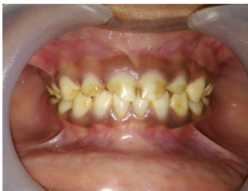
Figure 1: Pre-operative picture of occlusion

The treatment objectives were to improve aesthetics, improve periodontal health, prevent further loss of tooth structure, and improve the child's confidence. The treatment plan was to restore the affected teeth with full coverage restorations.