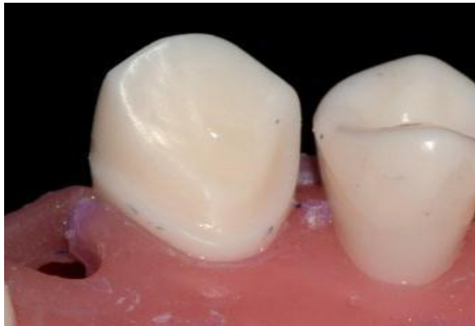
Figure 1 Palatal VRFDP preparations.