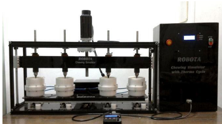
Figure 5 Robota chewing simulator.

The prosthesis were prepared one at a time: 5% hydrofluoric acid gel (IPS Ceramic etching gel, Ivoclar Vivadent) was applied on the fitting surface of the retainer wing for 20 seconds, washed thoroughly with air/ water spray then dried well with air. Silane coupling agent (Pre-Hydrolyzed Silane Porcelain Primer, BISCO) was then applied using micro brush on the fitting surface for 1 minute and dried gently with air.