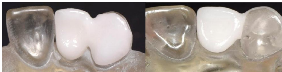
Figure 4 Palatal and Labial VRFDP