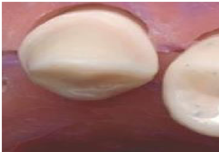
Figure 2 Labial VRFDP preparation

One epoxy model from each group was scanned using 3 axes blue scanner ( Identica Hybrid, Medit ). The designs were performed using Exocad program (version 6136). The STL file was ready to send to the 5 axes dry milling machine ( VHF K5, P&S ) for milling on PMMA blank to produce standardized patterns for the two groups. Each resin pattern was seated on its corresponding epoxy model and checked for its fit and marginal accuracy ( Figure.3 ). It was then sprued, invested, pressed and finished to form lithium disilicate resin bonded bridge (Ivoclar Vivadent) ( Figure.4 ).