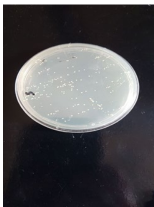
Figure 2: A photograph of Candida Albicans on Sabouraud Dextrose Agar (100/cm 2 )