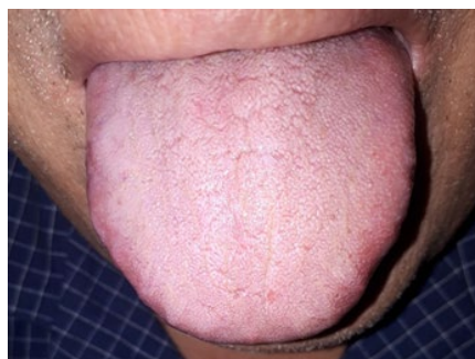
Figure 3: A photograph showing the dorsal surface of the tongue after seven days of application of 5% ACV

days. After the seven days were over another photograph was taken to the patient's tongue (Figure 3), and another swab was taken to count the number of isolated candida post-therapy. (Figure 4). Before the beginning of this case report, the patient signed a consent form that was checked by the Research Ethics Committee of Faculty of Dentistry, Cairo University. This study had the code number 171016.