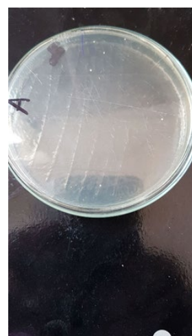
Figure 4: A photograph of Candida Albicans on Sabouraud Dextrose Agar after the ACV treatment (6/cm 2 ).